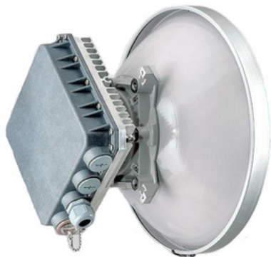
SAF Integra G Split Mount Radio System up to 1 Gbps (Outdoor Unit)