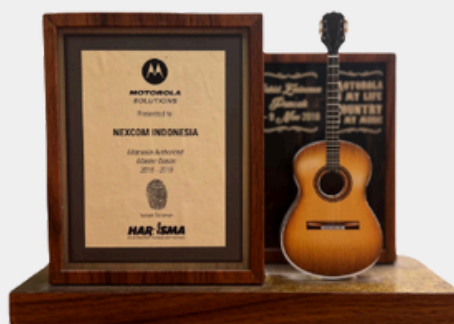
Solutions Partner of the Year 2018-2019