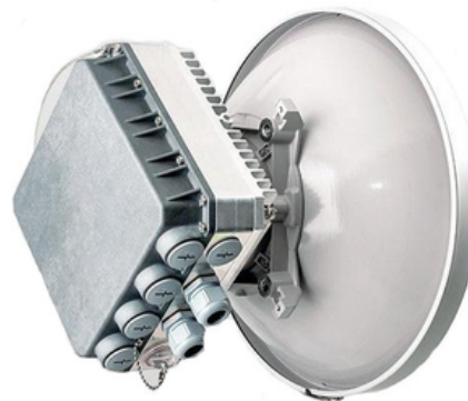
SAF Integra W Split Mount Radio System 883 Mbps (Outdoor Unit)