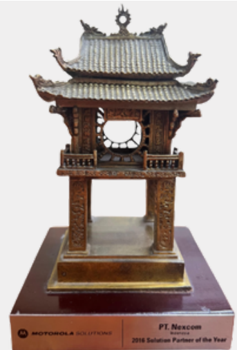
Solutions Partner of the Year 2016