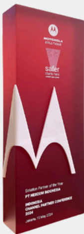
Solutions Partner of the Year 2024