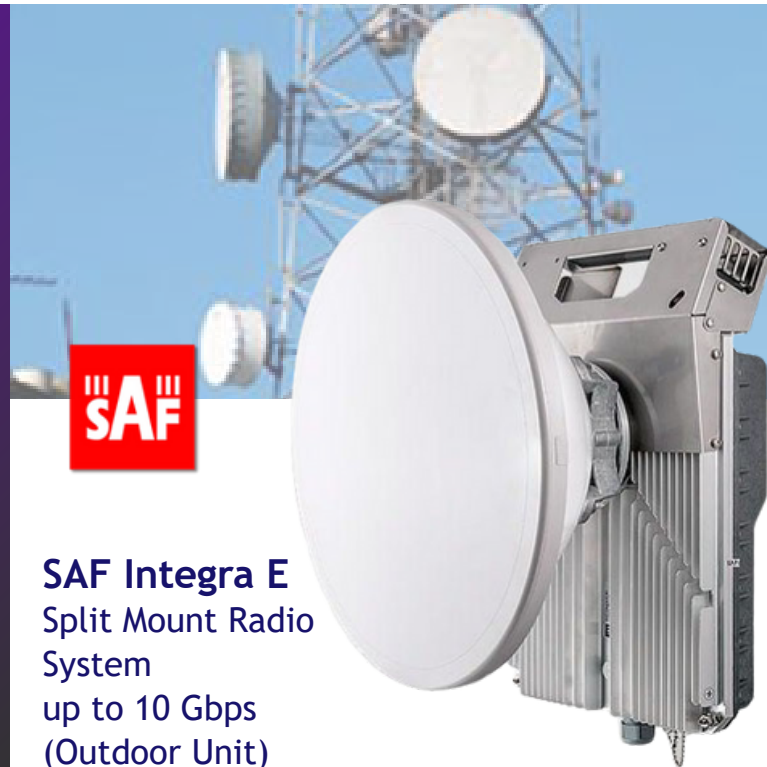
SAF Integra E Split Mount Radio System up to 10 Gbps (Outdoor Unit)