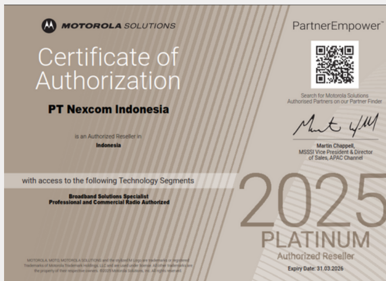
Platinum Authorized Reseller Motorola Solutions